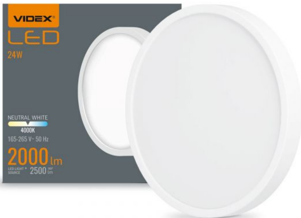
LED Surface Downlight Fixture