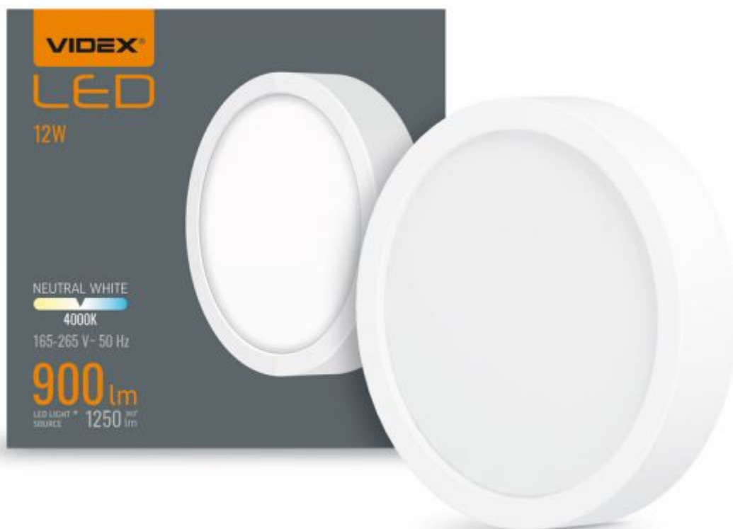
LED Surface Downlight Fixture