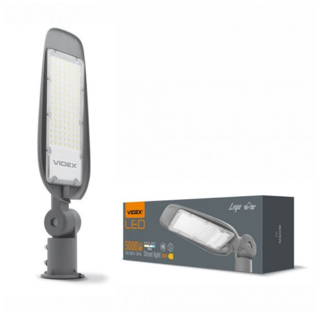
LED Street Light