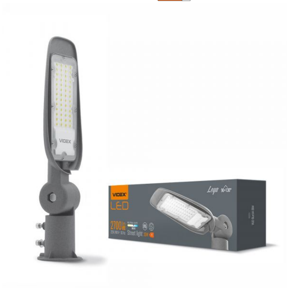
LED Street Light