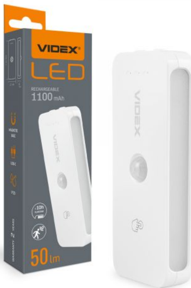
LED RECHARGEABLE NIGHT LIGHT with MOTION SENSOR