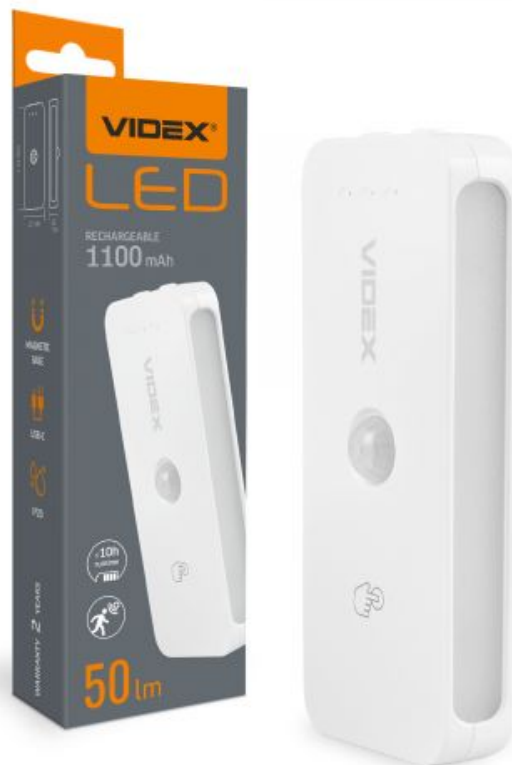
LED RECHARGEABLE NIGHT LIGHT with MOTION SENSOR