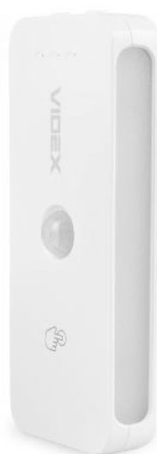
LED RECHARGEABLE NIGHT LIGHT with MOTION SENSOR