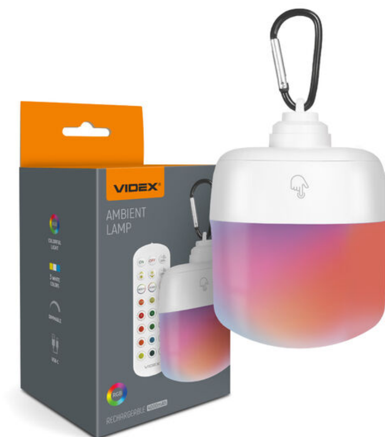
LED RECHARGEABLE LAMP with REMOTE CONTROL