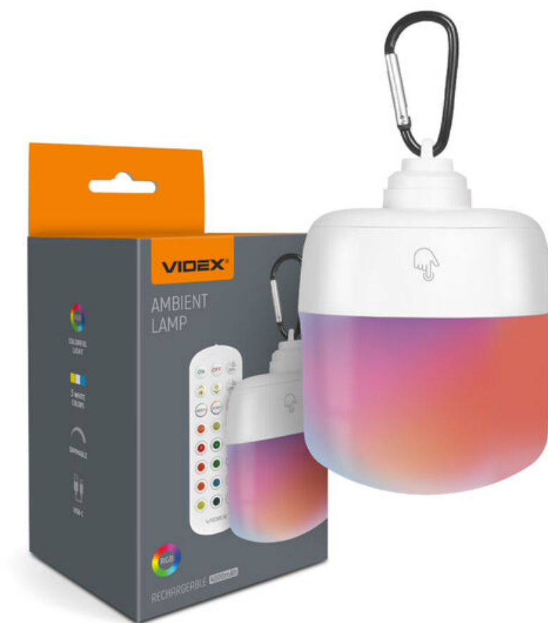
LED RECHARGEABLE LAMP with REMOTE CONTROL