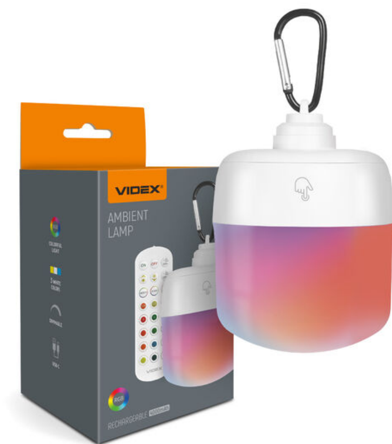
LED RECHARGEABLE LAMP with REMOTE CONTROL