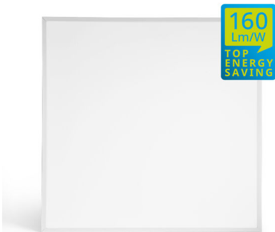
LED Recessed-mounted Panel