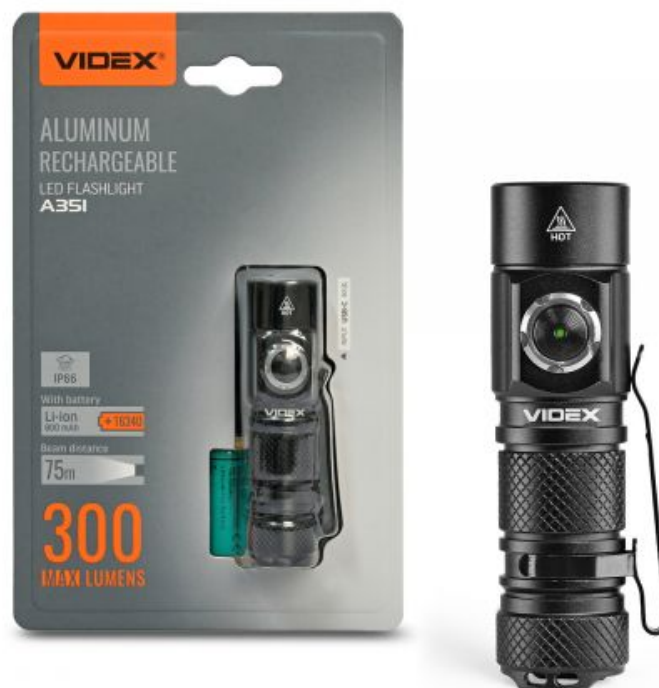
LED Portable Flashlight