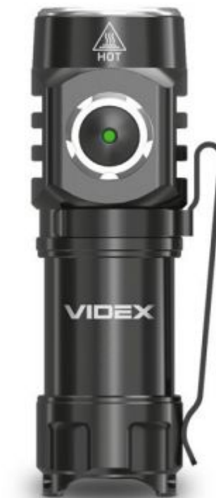
LED Portable Flashlight