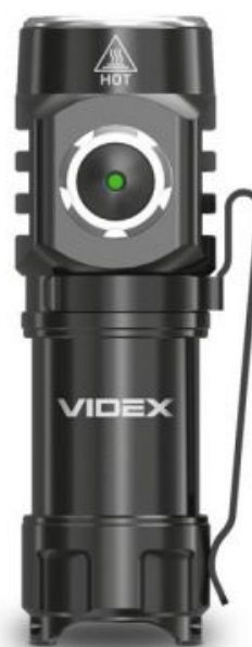
LED Portable Flashlight