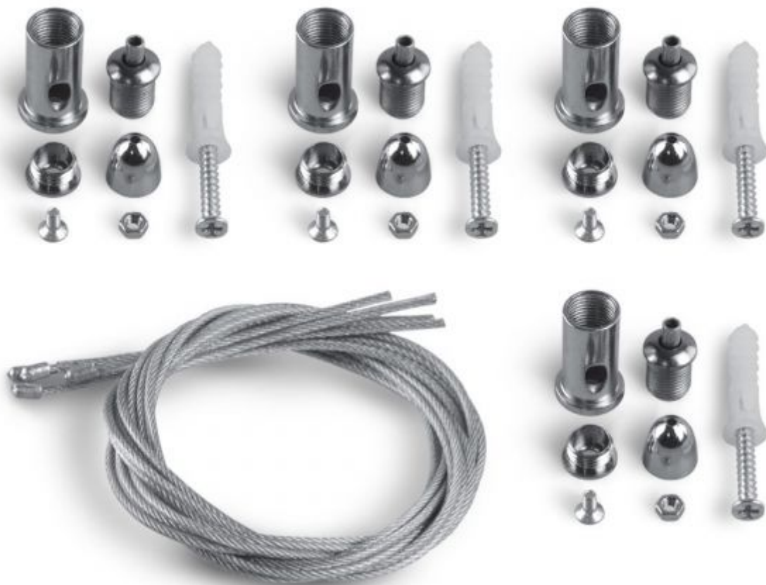
LED Panel suspension set