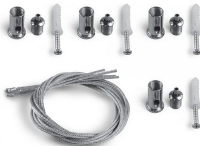
LED Panel suspension set