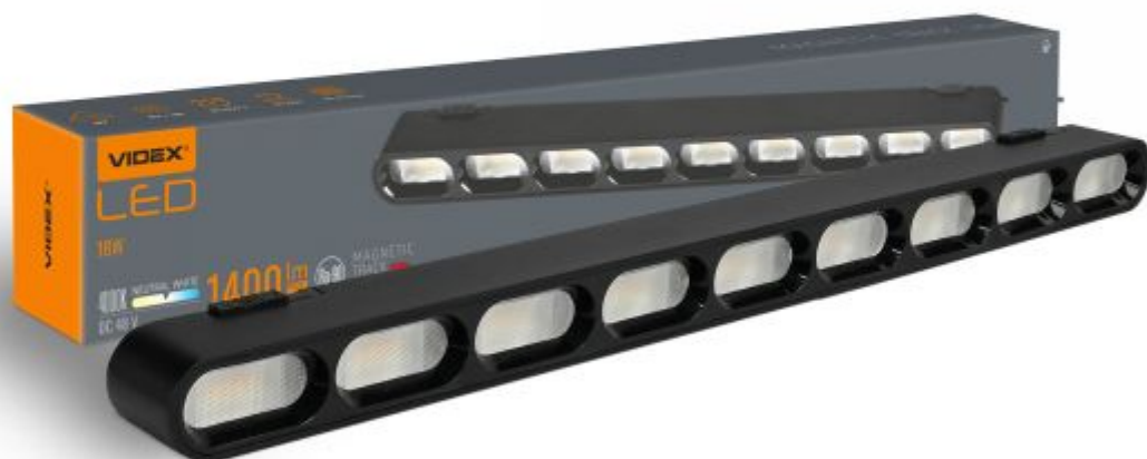
LED Light for Magnetic slim track light system