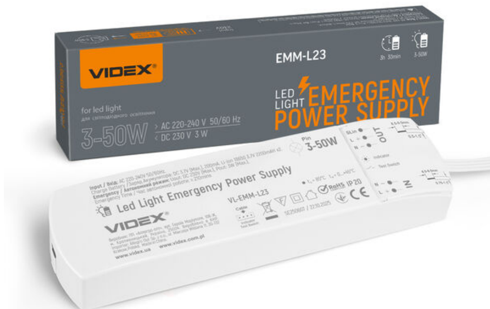
LED Light Emergency Power Supply