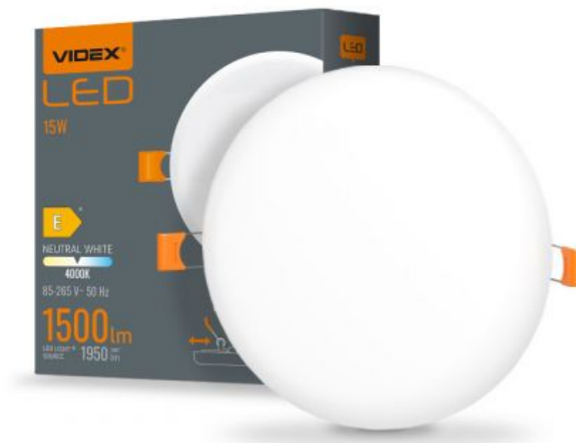
LED Frameless Downlight Fixture