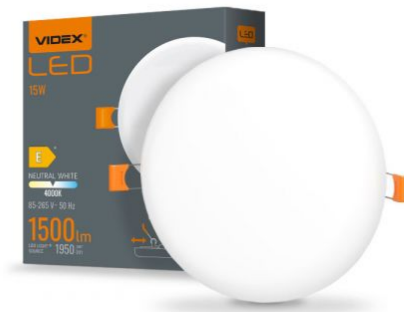
LED Frameless Downlight Fixture