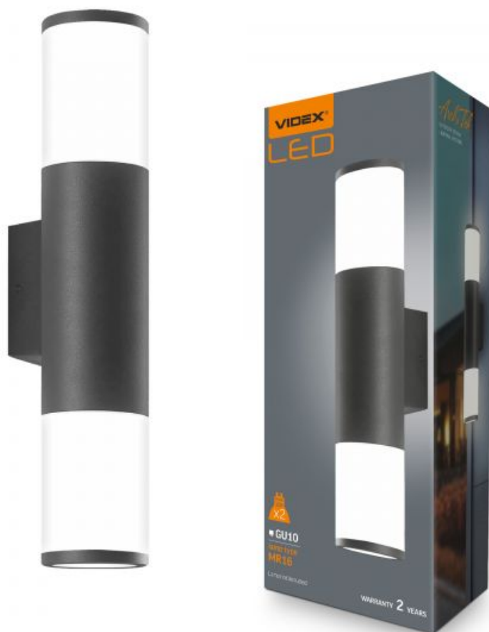
Led Fixture Architectural