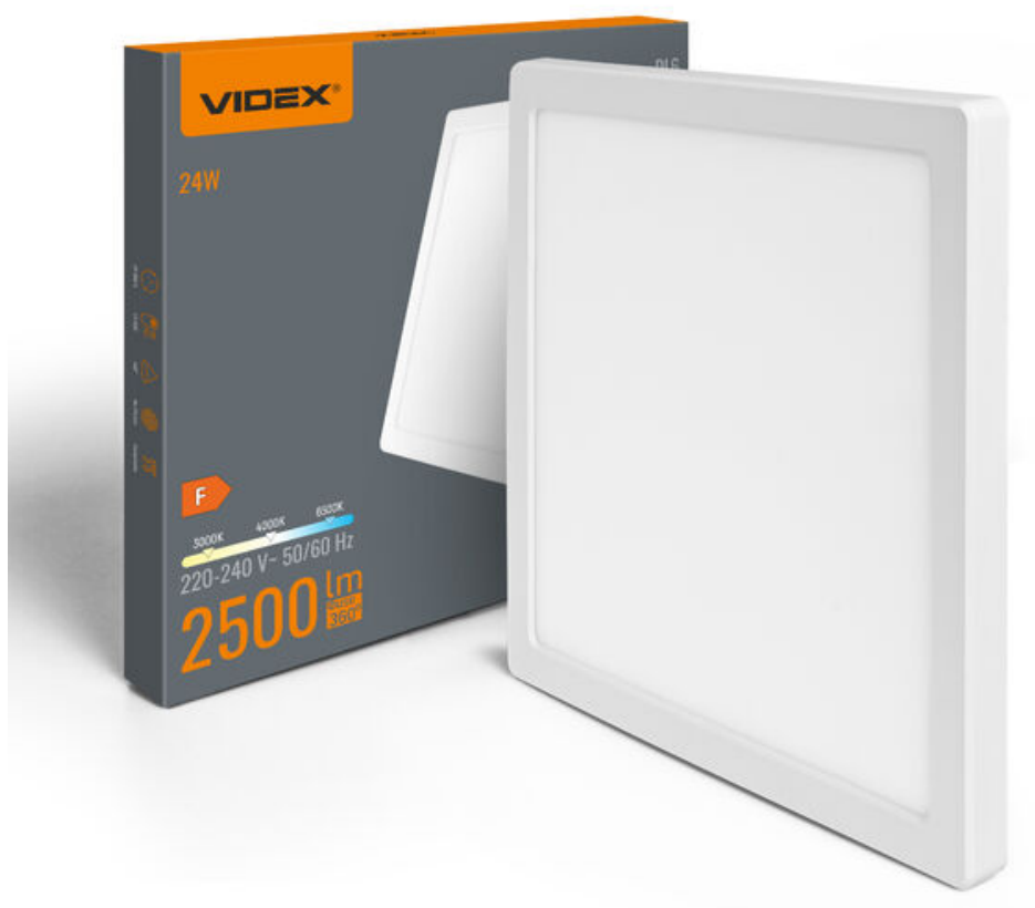
LED Ceiling Light