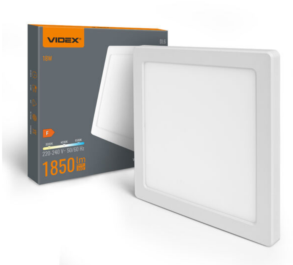
LED Ceiling Light