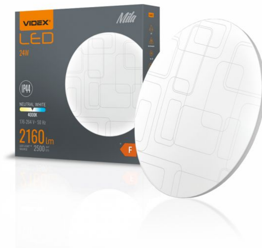
LED Ceiling Fixture