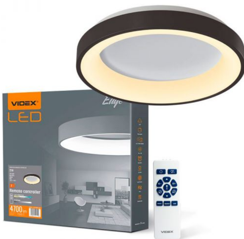
LED Ceiling Fixture