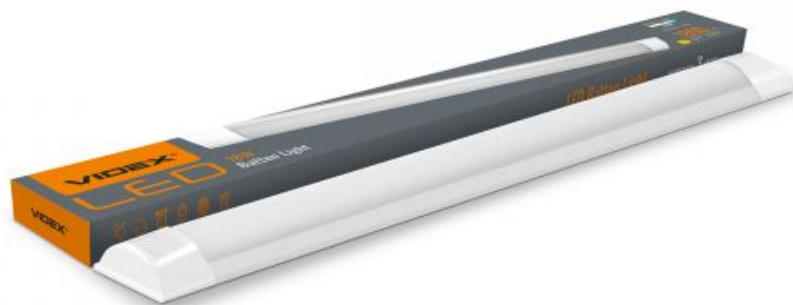
LED Batten Light