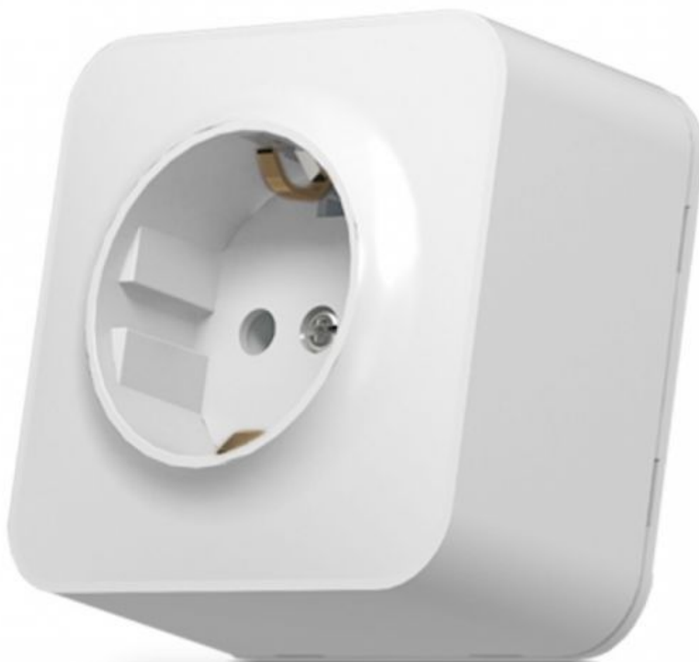
Surface-mounted single Schuko socket IP20 white