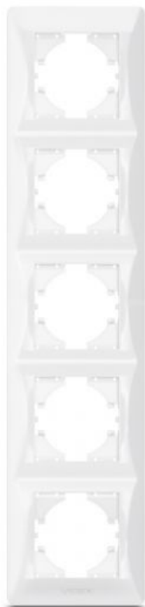
Frame 5 gang vertical white