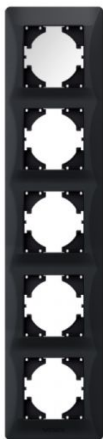
Frame 5 gang vertical black graphite