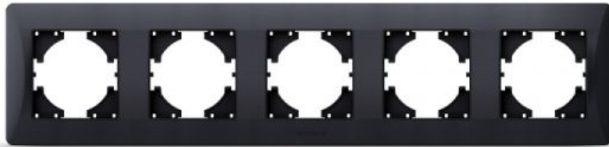
Frame 5 gang horizontal black graphite