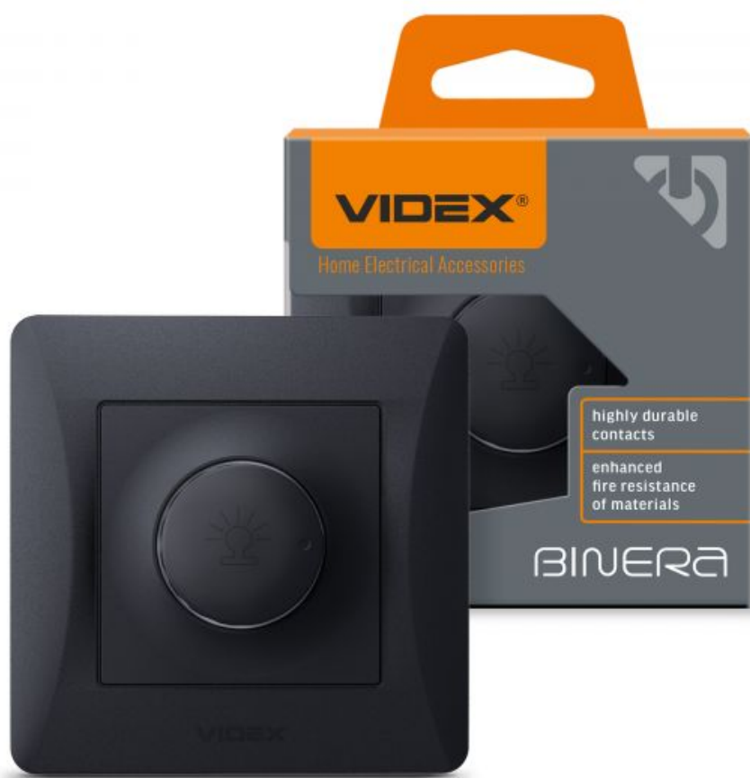
Dimmer 600W black graphite