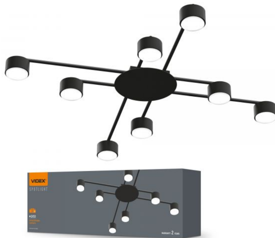
Ceiling spotlight luminaire