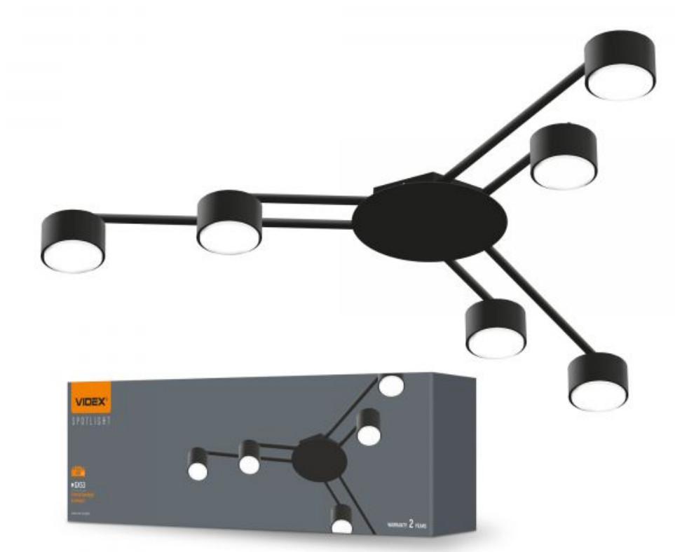
Ceiling spotlight luminaire