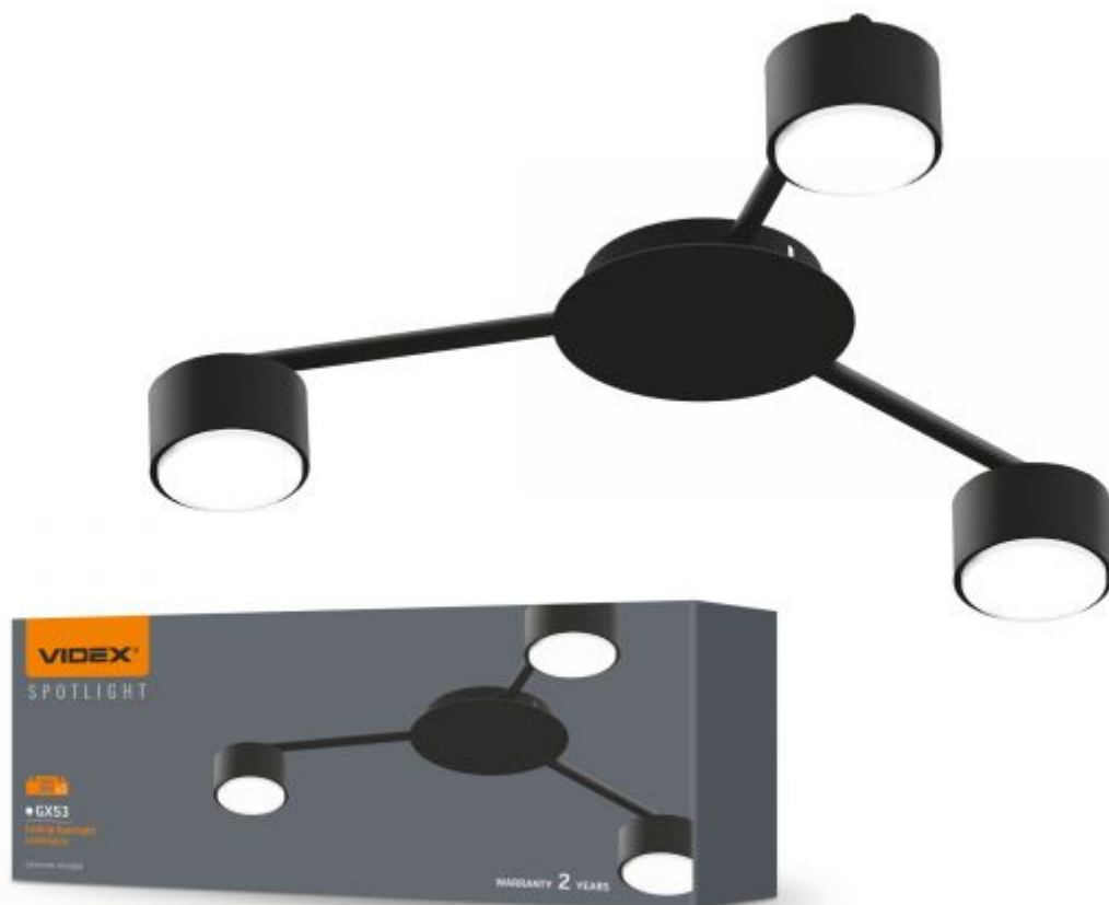
Ceiling spotlight luminaire