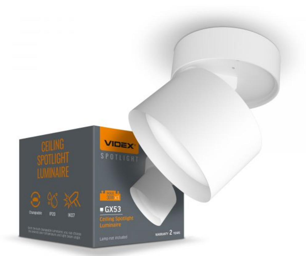
Ceiling spotlight luminaire