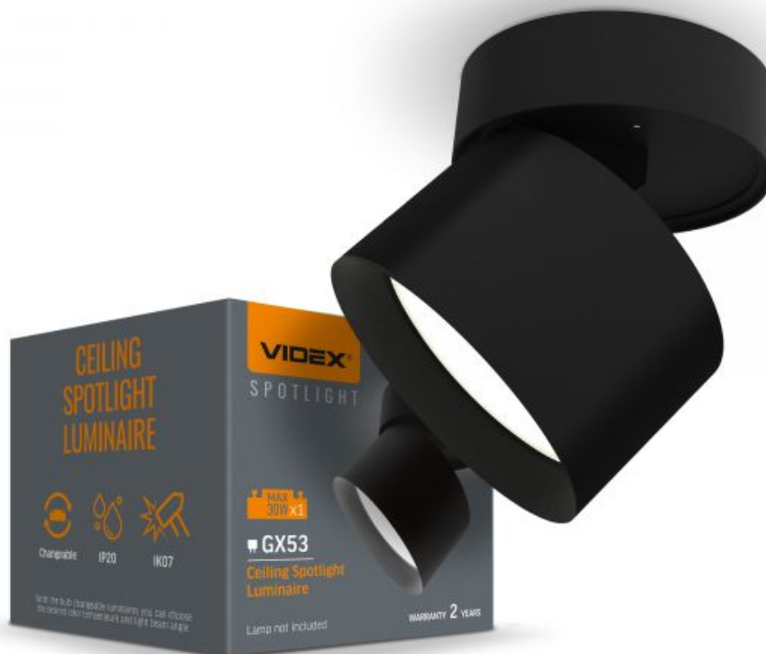
Ceiling spotlight luminaire