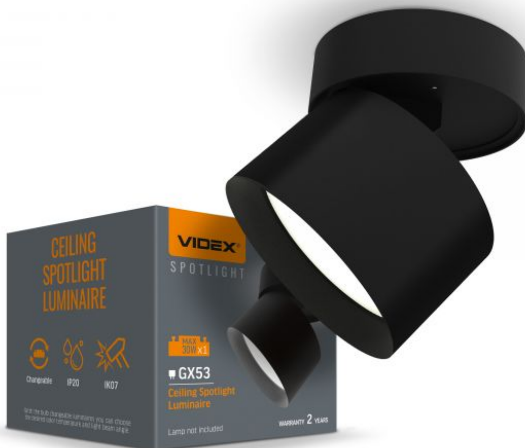
Ceiling spotlight luminaire