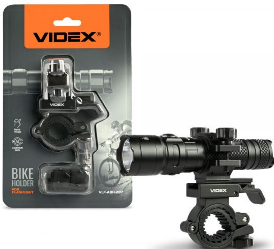
Bike Holder for Flashlights