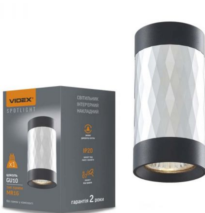
Ceiling spotlight luminaire