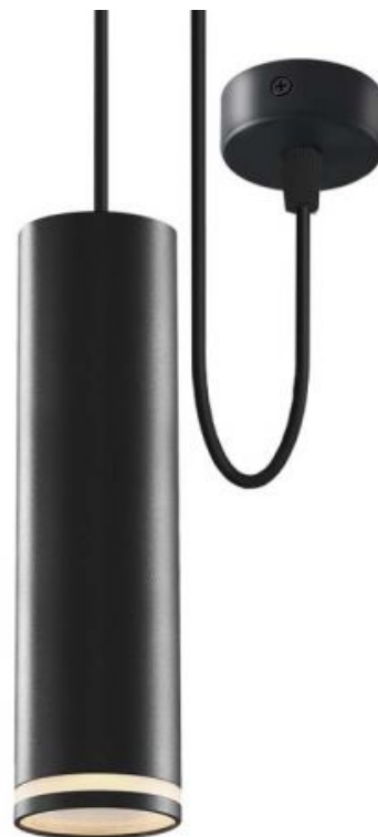
Pendant spotlight luminaire