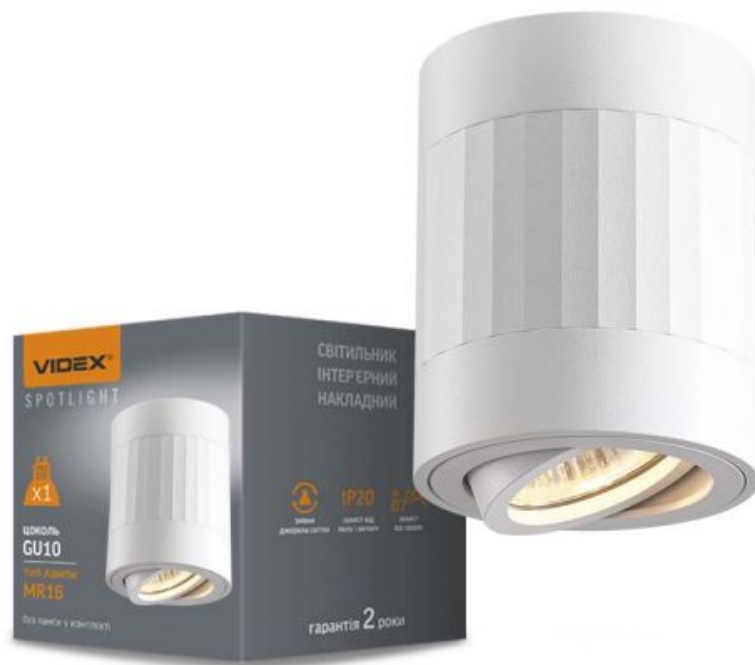
Ceiling spotlight luminaire