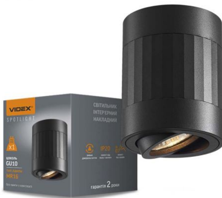
Ceiling spotlight luminaire