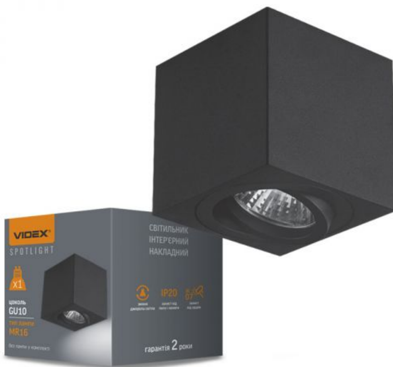
Ceiling spotlight luminaire