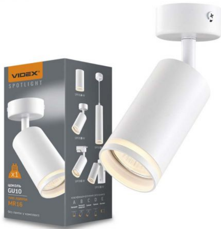
Wall and ceiling spotlight luminaire