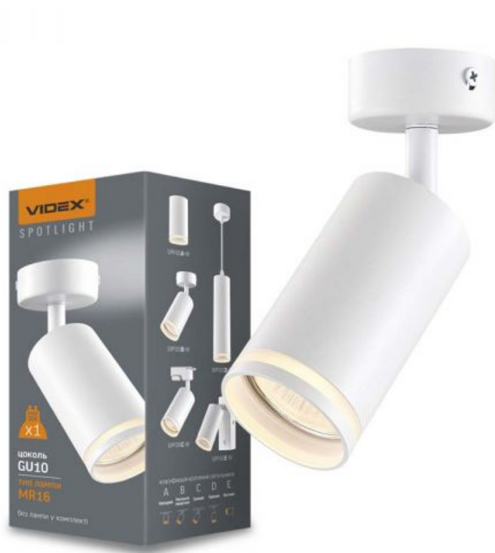
Wall and ceiling spotlight luminaire