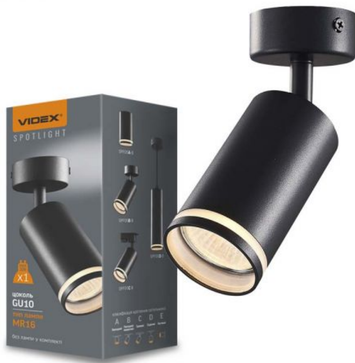
Wall and ceiling spotlight luminaire