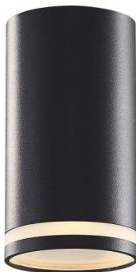
Ceiling spotlight luminaire