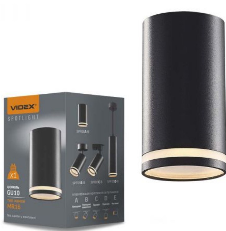
Ceiling spotlight luminaire