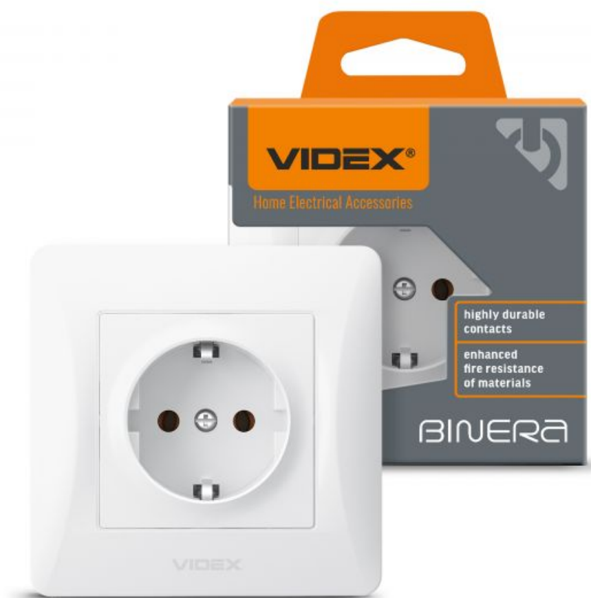
Single schuko socket white