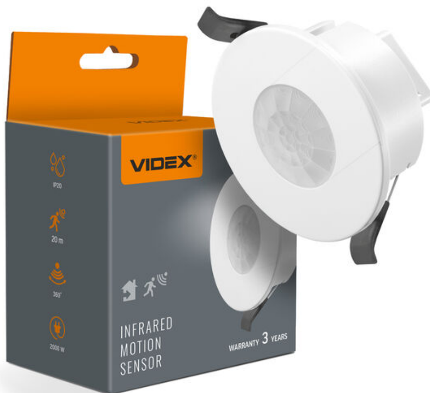
PIR motion and light sensor