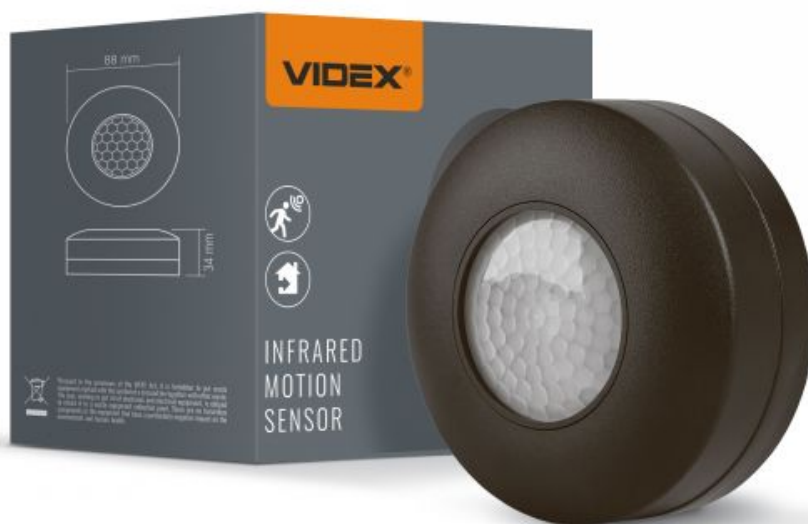
PIR motion and light sensor