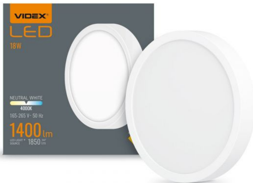
LED Surface Downlight Fixture