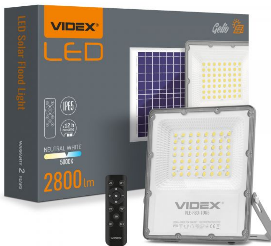
LED Solar Floodlight