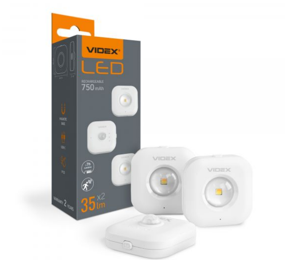
LED RECHARGEABLE NIGHT LIGHT with MOTION SENSOR