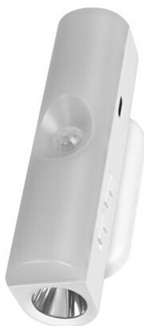
LED RECHARGEABLE NIGHT LIGHT with MOTION SENSOR