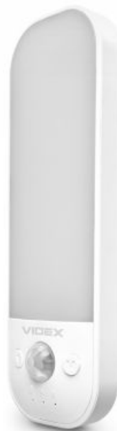
LED RECHARGEABLE NIGHT LIGHT with MOTION SENSOR