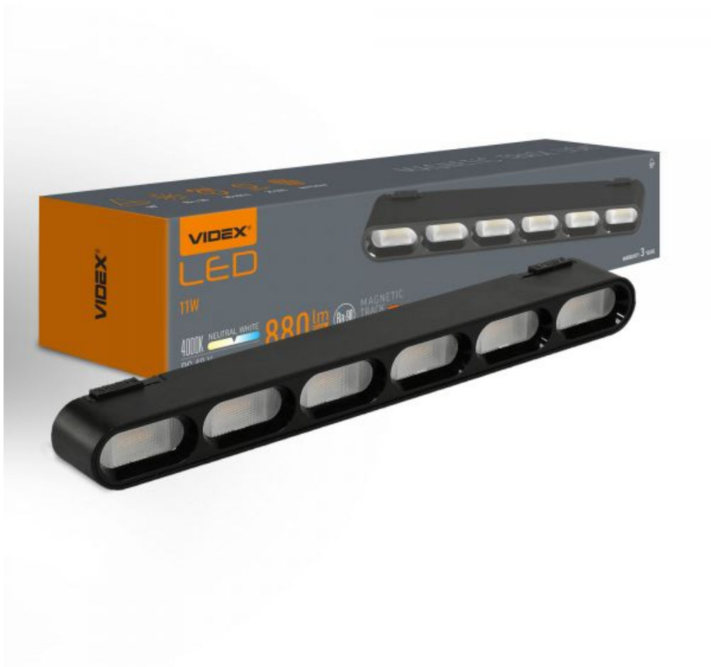
LED Light for Magnetic slim track light system