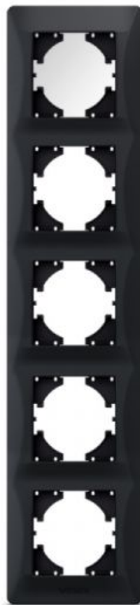
Frame 5 gang vertical black graphite