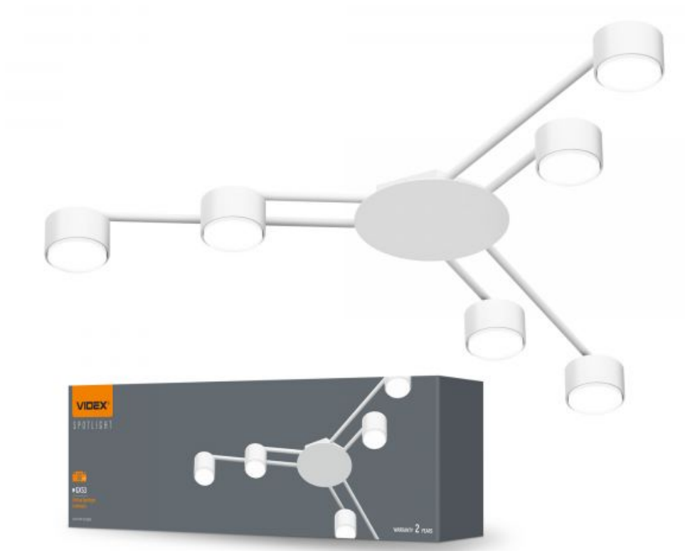
Ceiling spotlight luminaire