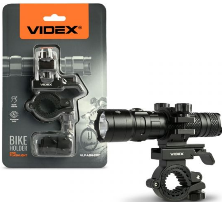
Bike Holder for Flashlights